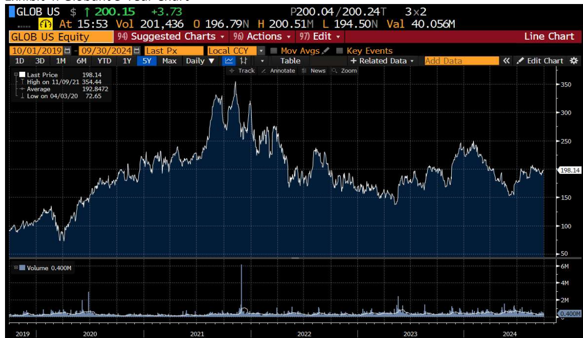
Exhibit 4: Globant 5-Year Chart

Globant's robust financial performance further solidifies its investment appeal. With $2.2 billion in revenue as of Q1 2024 and a consistent record of high margins, the company continues to deliver strong returns for investors. Its focus on expanding AI capabilities, combined with a disciplined approach to scaling operations globally, positions Globant for continued growth. As demand for digital transformation and AI services accelerates, Globant's ability to innovate at scale and deepen client relationships will only further differentiate their offerings.