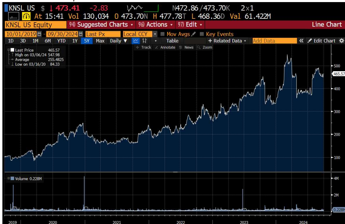
Exhibit 3: Kinsale Capital 5-Year Chart

competitive edge and deliver superior financial results. Under his guidance, Kinsale continues to thrive, making it a compelling investment opportunity for many years to come.