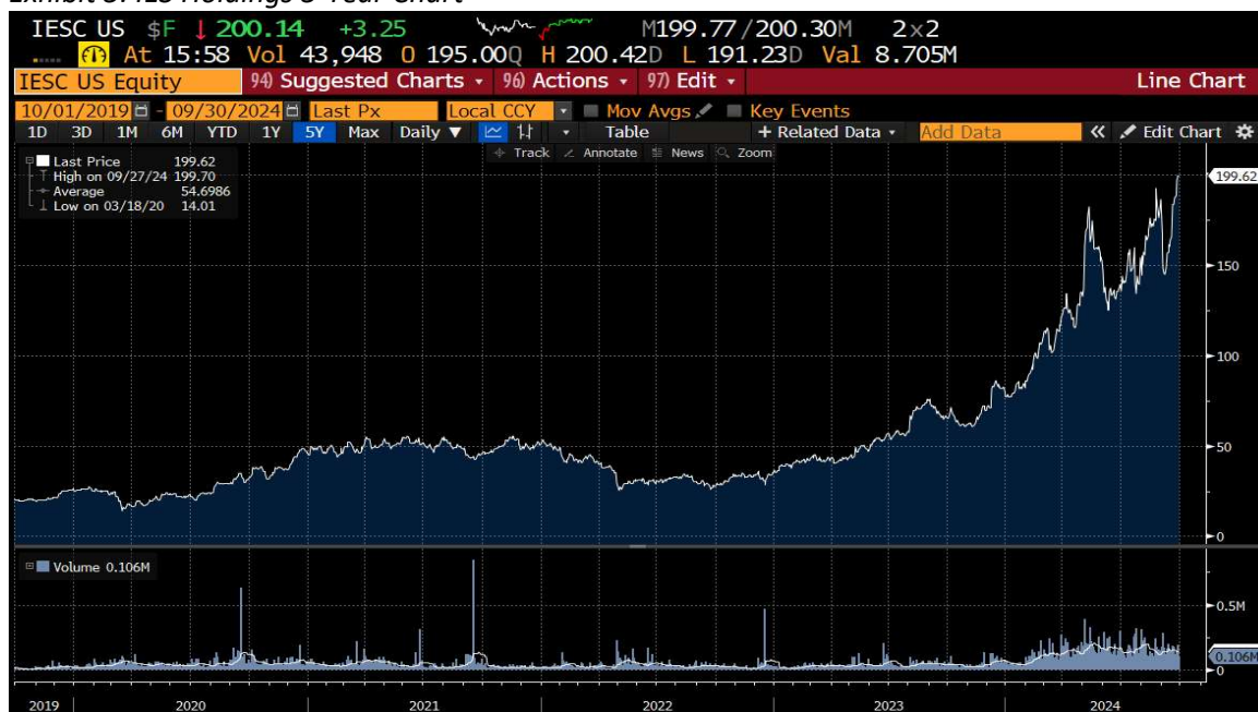
Exhibit 5: IES Holdings 5-Year Chart