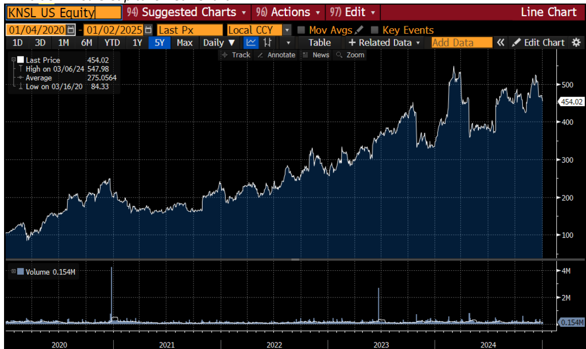
Exhibit 3: Kinsale Capital 5-Year Chart