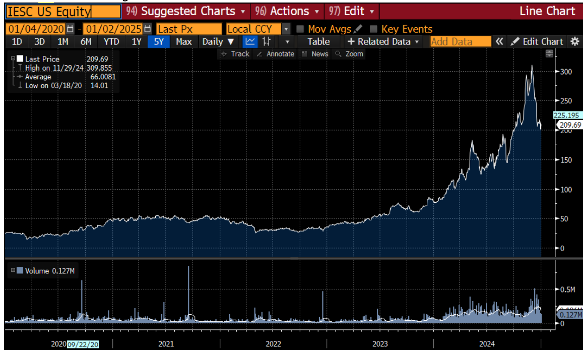
Exhibit 5: IES Holdings 5-Year Chart