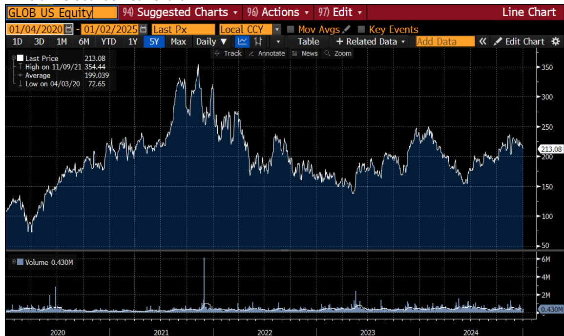
Exhibit 4: Globant 5-Year Chart

The investment thesis for Globant is supported by its position in the fast-growing IT services market, expected to expand at a 9% compound annual growth rate (CAGR) through 2027. Globant is capitalizing on the demand for AI-driven solutions, already generating over $100 million in AI-related revenue in 2023. Its diversified service offering across industries, combined with strong client relationships—evidenced by a high retention rate and a growing number of clients generating more than $1 million in annual revenue—gives it a competitive edge.