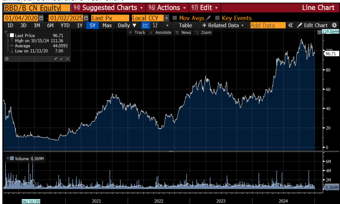
Exhibit 2: Bombardier 5-Year Chart

The company's solid book-to-bill ratio and the order for 244 aircraft from NetJets suggest a strong competitive position that will likely endure through the late 2020s. Most importantly, we do not foresee any capital-intensive projects in the near-term, which means that solid free cash flow generation will benefit shareholders. However, we are aware of likely forthcoming capital investments several years out, which must be properly reflected in DCF-based valuation. We encourage thoughtful investors to forego using EV/EBITDA valuation methodology, which does not incorporate future capital requirements. Overall, over the next 1-2 years Bombardier should be on track to achieve an increasing margin profile while reducing its leverage. This financial strength should enable significant capital returns to shareholders through share buybacks and dividends.